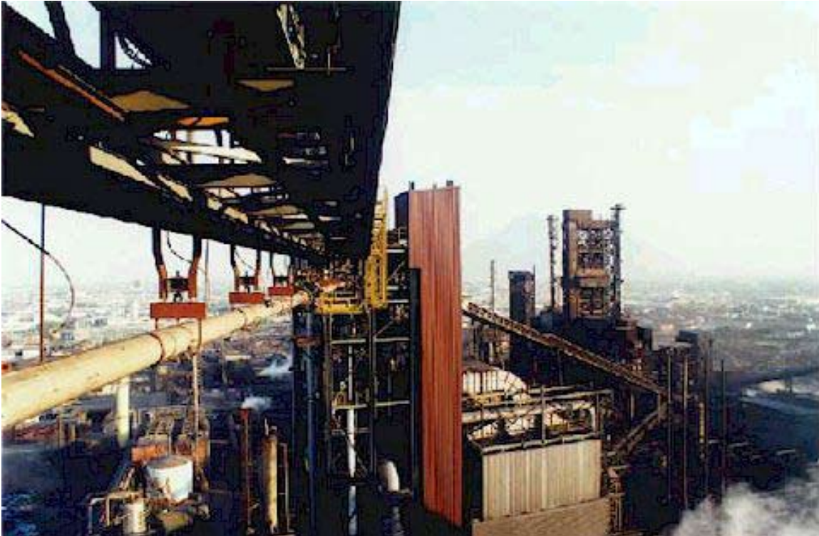
Figure 1: An aerial view of the high temperature pneumatic conveying transfer line, 45 meters above ground level at an iron ore plant in Mexico

Fifteen years ago, we were asked by a steel plant in Mexico to develop a system for conveying large abrasive particles pneumatically. The one condition was that we should try to keep particle breakage to a minimum. The client also told us that the product was highly reactive with air, temperature ranging from 35°C to 900°C, and when conveyed hot, the heat loss should be kept at a minimum. Because particle sizes and conveying capacities were continuously being changed, we were asked to develop a general scale-up procedure that would cover a whole range of possibilities, while keeping operative cost to a minimum.